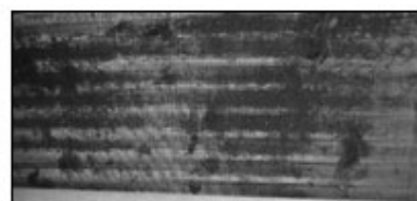
Before GAZ- CC01